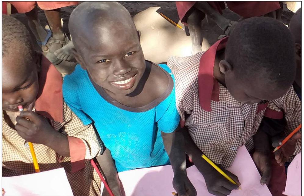
Children are thriving at Catholic schools in South Sudan thanks to the blessing of your Sudan Relief Fund donations.

school is a ray of hope and provides comprehensive support — a refuge offering protection, food, education, clothing, health care, and social and spiritual formation for hundreds of young girls. With the support of donors like you, Sudan Relief Fund has funded the school’s food program for four years, helping to keep these vulnerable girls fed and safe.