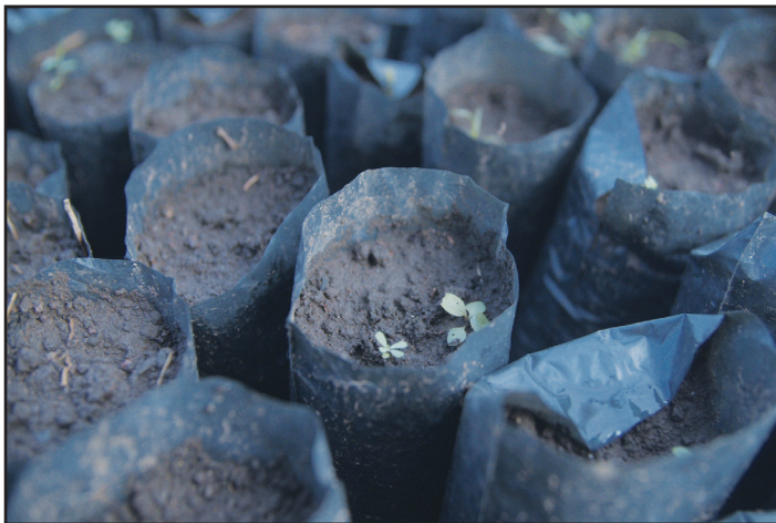
Local parish coffee production is providing sustainable income

Another example of enterprise development can be found even in such an unlikely place as the Rimenze refugee camp near Makpandu. Microfinance loans provided by Sudan Relief