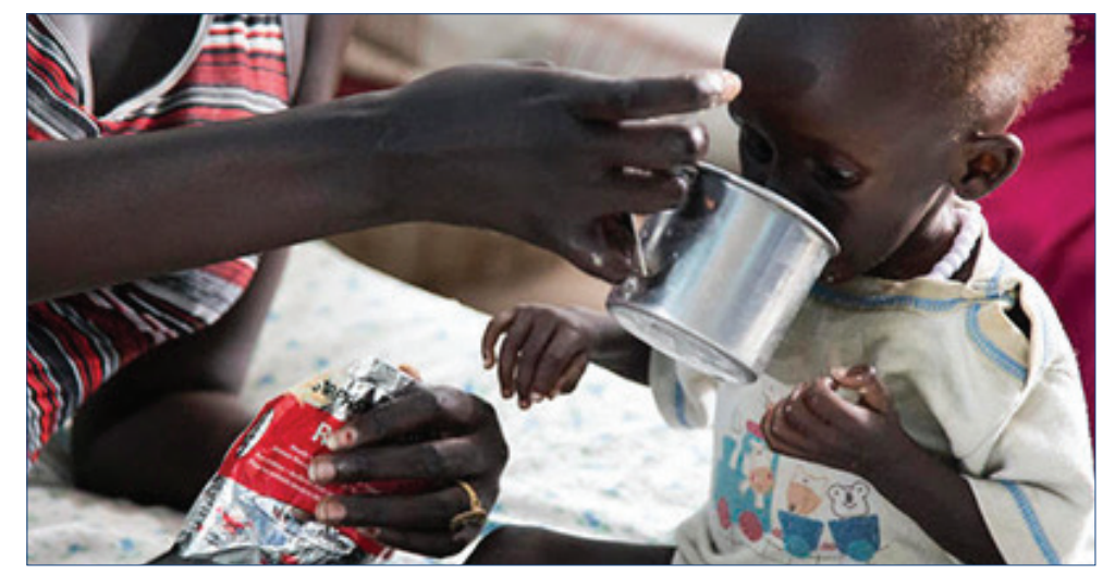
Your prayerful support helps us save those most in danger of famine including 29,000 young children.

Sadly, a famine would just be the latest of all the horrors inflicted upon these innocent and forlorn people. The tens of thousands dead and the millions displaced have suffered a staggering list of atrocities including genocide, child trafficking, rape, castration, and entire villages burned to the ground.