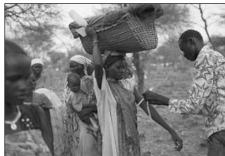
Educating deserving students today is key to creating a stable South Sudan tomorrow.

“FAO South Sudan is adapting its operations and prioritizing emergency livelihood interventions to reach people who are severely food insecure, but the main concern is safety and accessing these people in time,” said FAO Representative Serge Tissot. He added, “To avoid a further and potentially catastrophic decline in the food security situation of the most vulnerable, it is critical that partners continue and possibly expand their work on emergency livelihood support as well as on building resilience.”