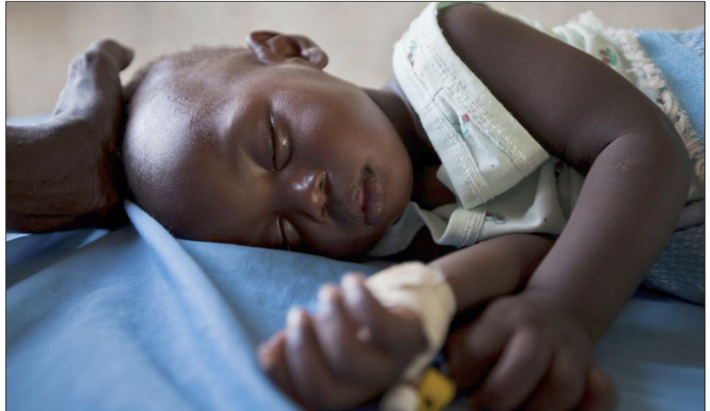
The current malaria outbreak in South Sudan is unprecedented and shows no signs of letting up. We are committed to helping these poor people combat this deadly disease.

South Sudan is experiencing an “unprecedented” outbreak of malaria, with many observers stating that this year’s malaria outbreak is the most severe ever seen in the country. According to the United Nations Coordination for Humanitarian Affairs (OCHA), there have been approximately 1.6 million malaria cases reported so far, with some areas of South Sudan having more than quadrupled their numbers from the same period last year.